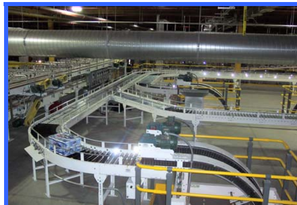
HILMOT MDR SYSTEM