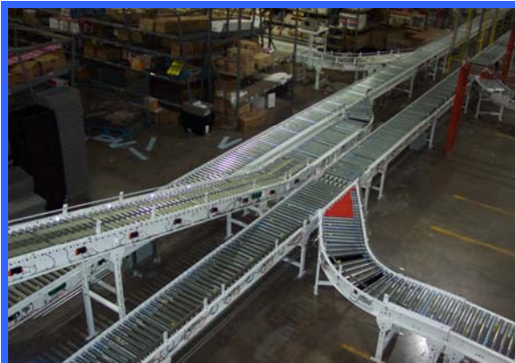
HILMOT MDR BELTED ZONE DECLINE