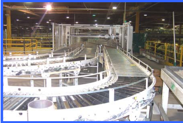
HILMOT MDR ROLLER CURVE